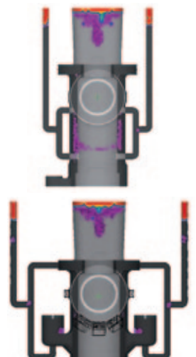
Porosity Defect inside the part & riser (top) which typically arises with traditional design, but which can be anticipated and corrected (bottom) with the use of a simulation solution such as ProCAST