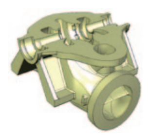
Example of a steel casting produced by DSB EURO

Thanks to ProCAST, production planning is progressively changing to allow the implementation of daring technological options that can first be validated through simulation. One example is the following casting which was actually an interesting part for DSB EURO but apparently too big to be produced in their foundry based on traditional rules.